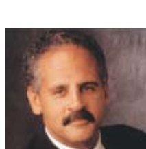
2008 Featured Keynote, Best-Selling Author and Businessman, Stedman Graham will share the nine steps to leadership success from his book, Teens Can Make it Happen