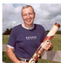
Affectionately known as "Kentucky Joe" from the CBS television series Survivor , Rodger Bingham will be share how a healthy lifestyle has helped him to not only "survive", but to thrive as a leader!

The Mission: The Great Kids Summit is a unique leadership experience for youth from all walks of life. They participate in a professional style conference complete with an engaging mix of renowned speakers, interactive workshops, dynamic training, entertainment, celebration and recognition. Centered around the Five Promises, the Summit is an excellent opportunity for young people (ages 12 & up) to experience caring adults, safe places, a healthy start, marketable skills and opportunities to serve.